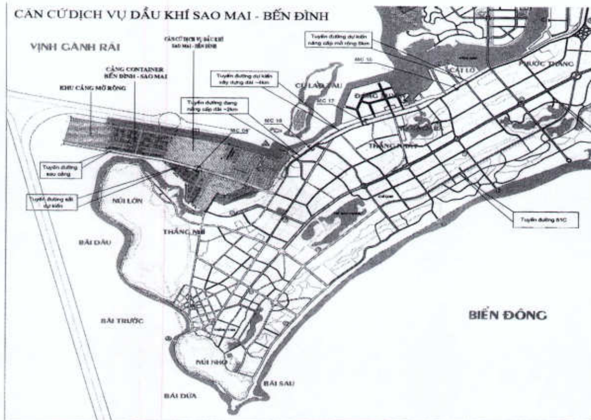
(Location of Sao Mai-Ben Dinh Petroleum Marine Services Port Base Project at Vung Tau)